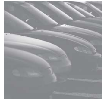
GM has extended its ClearVu Remarketing license through 2008 to maintain profit optimization in the re-sale channel.

Addressing the complex needs of the re-sale marketplace, ClearVu Remarketing considers current and future prices, auction location, fixed and variable costs such as transportation costs and auction fees, market saturation, seasonal changes, and more. The software adapts and learns from this vast set of variables, and recommends an optimal price and auction site for every vehicle, at any given time of year. With ClearVu Remarketing, auto resellers improve vehicle logistics efficiency, decision making, and operating results.